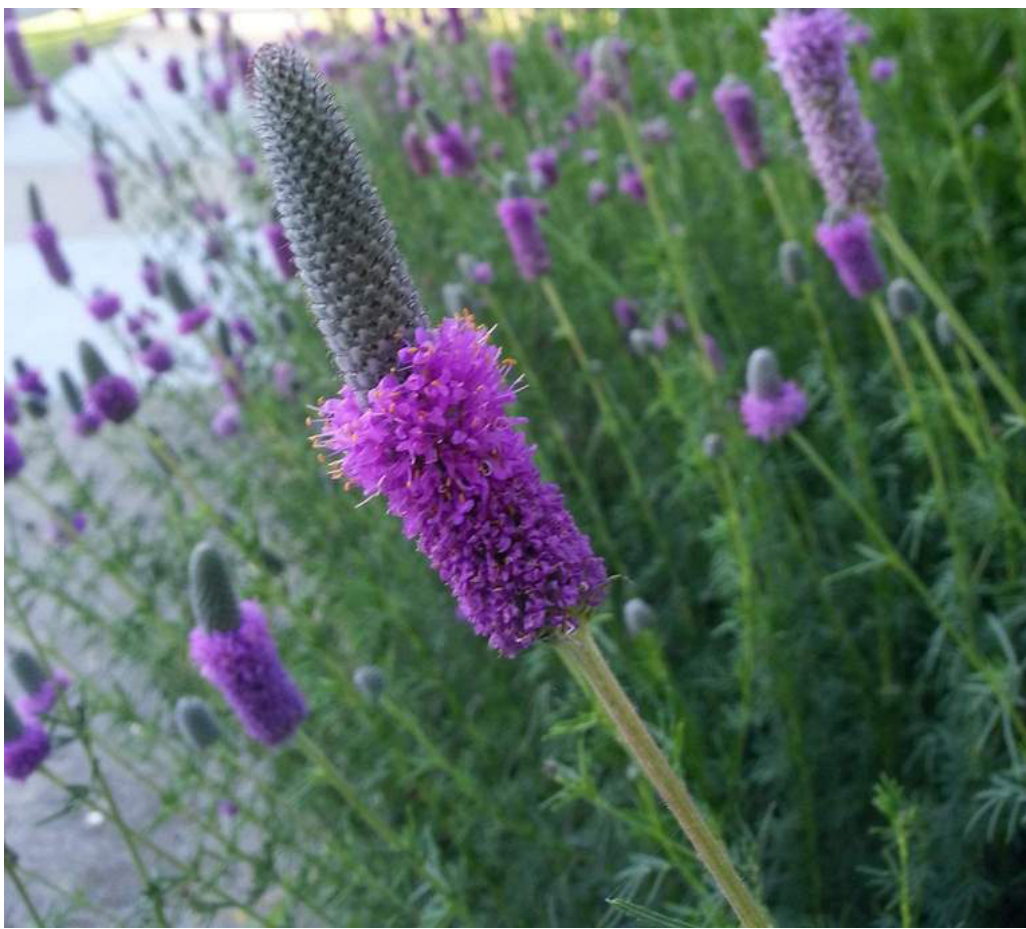
Purple Prairie Clover Dalea purpurea