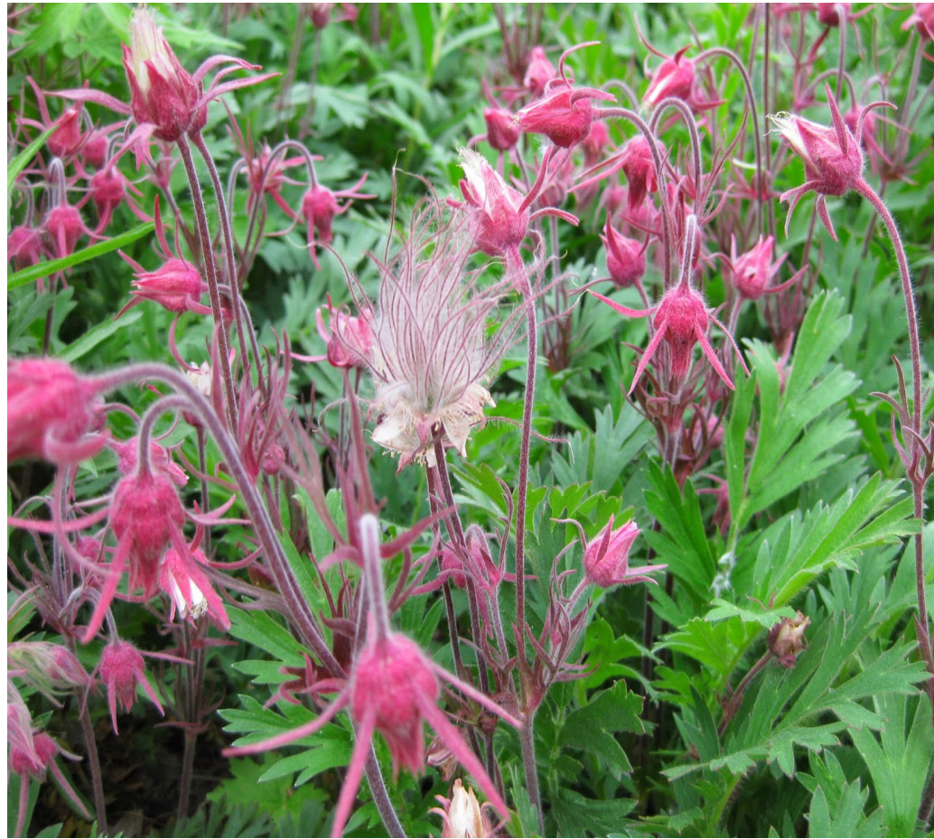
Prairie Smoke Geum triflorum