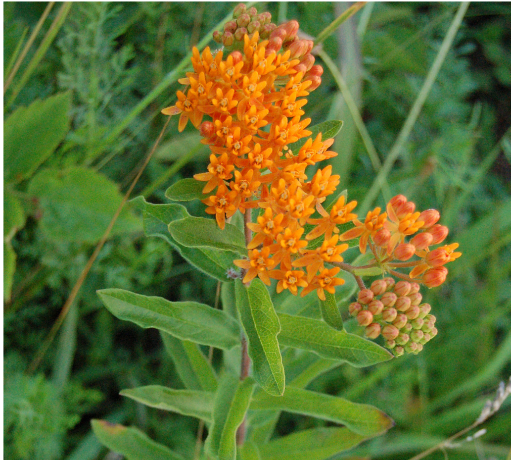
Butterfly Milkweed Asclepias tuberosa