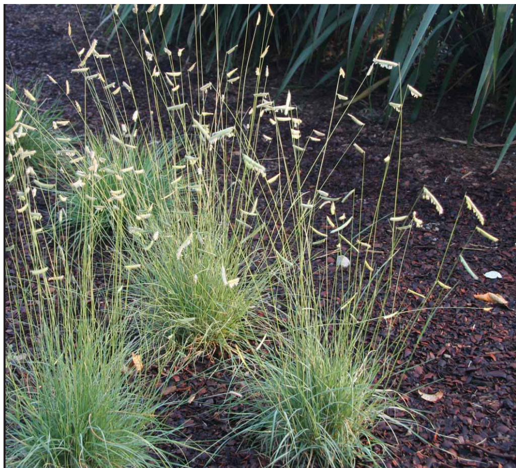
Blue Grama Bouteloua gracilis