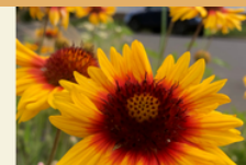
Native Blanketflower (Gaillardia aristata)