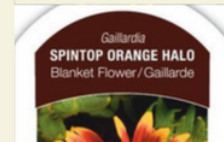
Cultivar plant tag