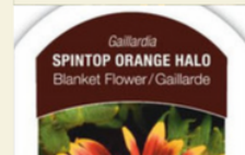
Cultivar plant tag